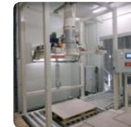
➤ Dosing and weighing: automation and ergonomics filling station