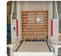
➤ Pallet unstacker for 15 of multi-format pallets