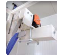
➤ Automatic big bag release: process time optimization